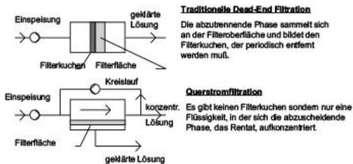
Abb. 1: Vergleich zwischen Querstrom- und Frontalfiltration

The process differs from traditional filter processes in that the phase to be separated does not collect on the surface and forms the known filter cake, but the concentration takes place in the liquid itself.