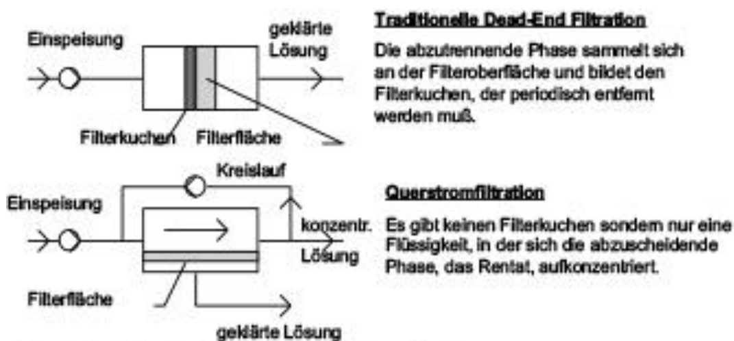
Abb. 1: Vergleich zwischen Querstrom- und Frontalfiltration

The process differs from the traditional filtration process by the fact that the phase to be separated does not accumulate at the surface, forming the well-known filter cake, but the concentration takes place in the liquid itself.