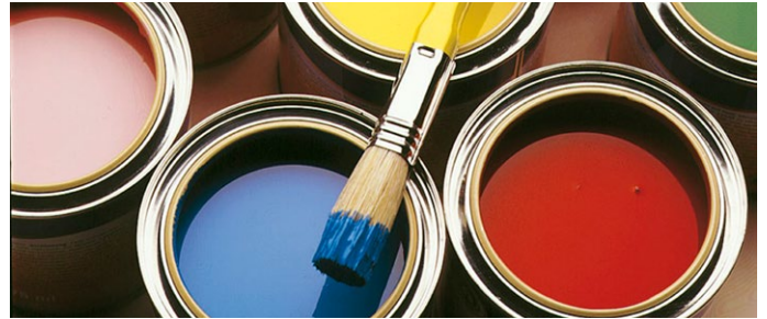
Higher filling levels in VOC formulations