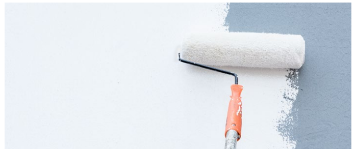
Extender in DIY colors