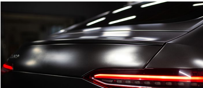
OEM primers and top coats