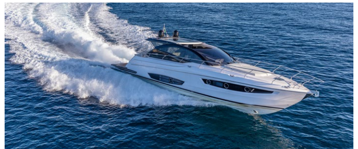
Gel coats and antifouling