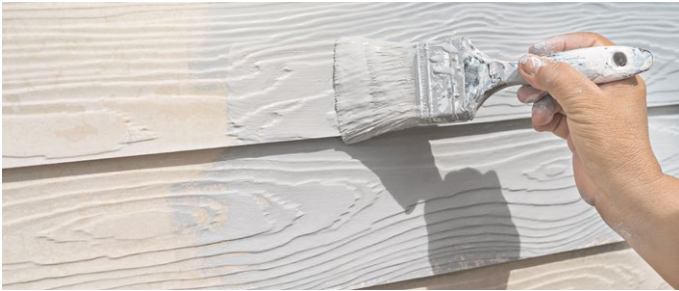
Coverage and stain protection