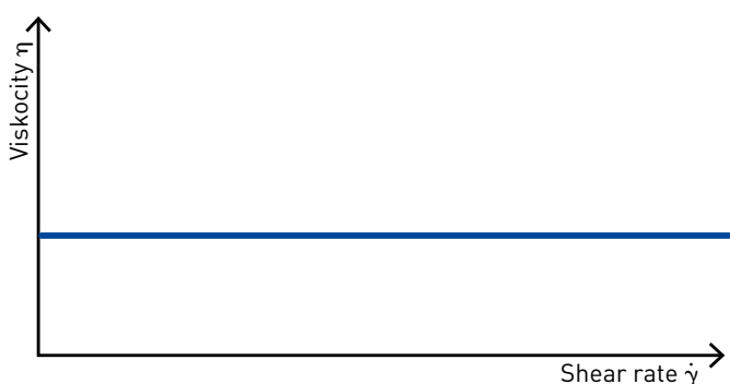
Figure 1: Ideal viscous (Newtonian) flow behaviour

Oscillatory tests are used to obtain further information on viscoelastic properties such as storage modulus G' and loss modulus G'' . These tests are particularly preferred when, as in the case of adhesives and sealants, rather pasty and semi-solid materials are involved whose structures have higher strength and elastic components.